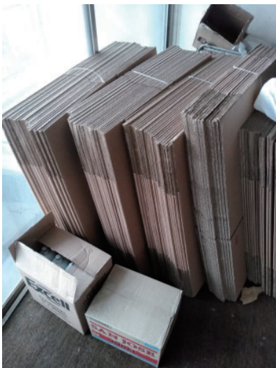
Boxes before assembly