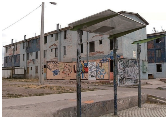
"La Bandera" Neighborhood