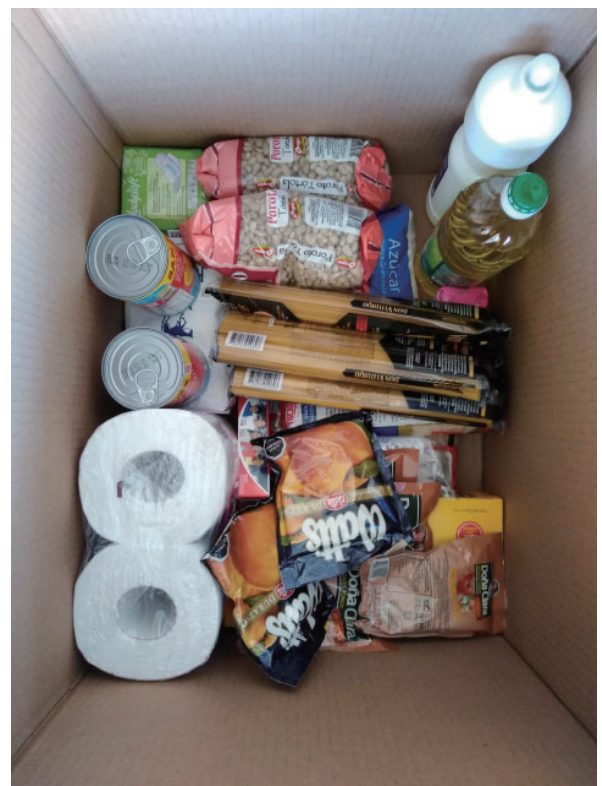
Contents inside the box