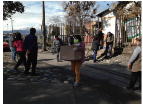
Boxes being delivered to the Bajos de Mena neighborhood