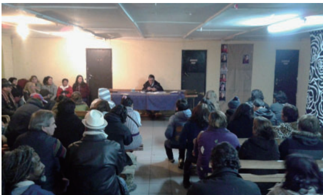
Informal market members in a community meeting