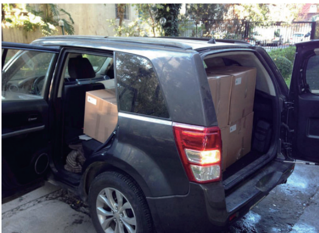
Boxes being loaded