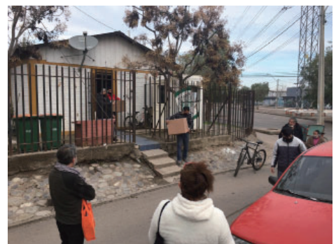
Boxes being delivered to the Bajos de Mena neighborhood