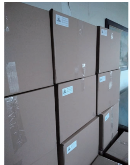
Boxes ready for delivery