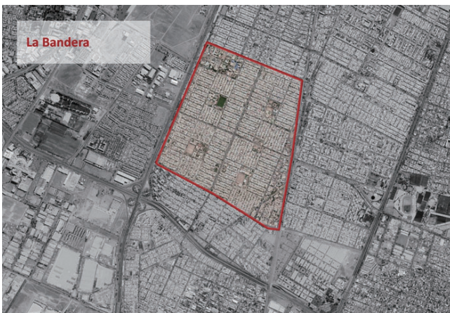
Aerial map of La Bandera neighborhood

The first 25 boxes with food and supplies were delivered to the community in La Bandera neighborhood on Saturday June 13th. These 25 boxes were delivered to the poorest members of the community, people who recently lost their jobs, single mothers, etc.