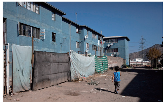
"Bajos de Mena" neighborhood