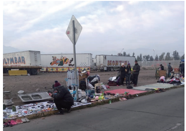
"Informal Market" Bajost de Mena