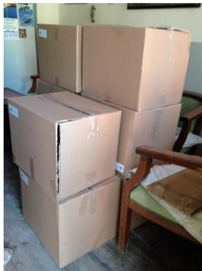
Boxes being prepared