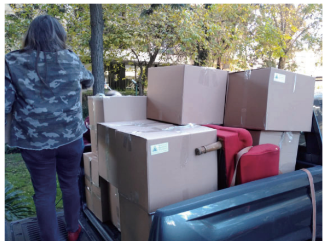
Boxes being loaded